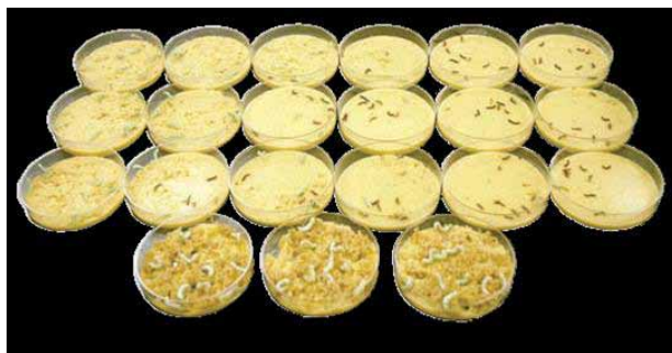
Each batch of DiPel is tested on over 2000 lepidopteran larvae at various stages in manufacturing.

Tests on Bt products have shown that some contain low levels of toxin proteins and low potency resulting in reduced efficacy. Both DiPel and XenTari are manufactured to the highest standards by Valent BioSciences (VBC) in the USA. VBC see fermentation of the insecticidal proteins produced from Bt strains as a mixture of science and art. Every batch of DiPel and XenTari must meet a number of sampling and potency checks throughout production to ensure the quality and efficacy of the toxin proteins in every batch.