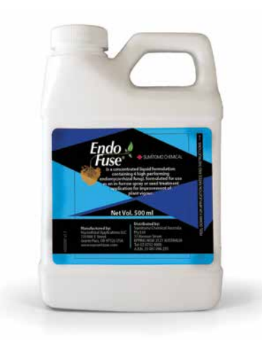
EndoFuse comes in convenient 500 mL packs that treat between 35-50 ha of sugarcane.