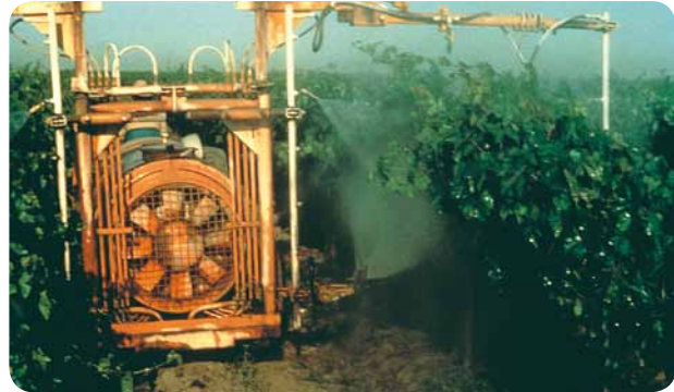
Complete coverage is vital

ProGibb G.A. is compatible with DiPel® DF Biological Insecticide and Sumisclx® 500 Fungicide.