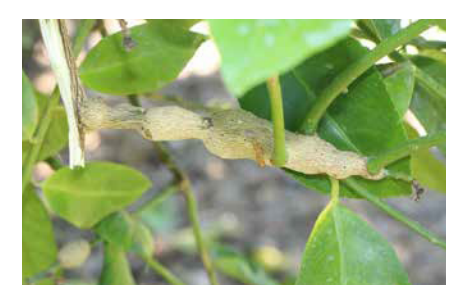
Citrus trees severely infested by citrus gall wasp showing galls from previous season

If pulp is to be supplied for annual feed it should be tested to ensure it complies with the MRL and ensure customers understand that the pulp should not comprise more than 10% daily intake for beef and dairy cattle for any prolonged period of time.