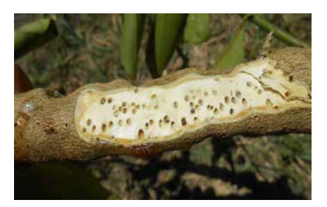
Last season gall