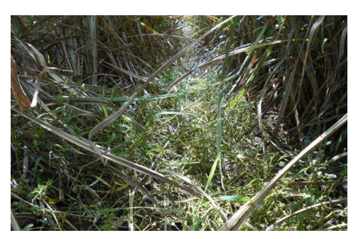
Untreated control 54 DAT

Use pattern: Applied to bare soil, Burdekin, N Qld